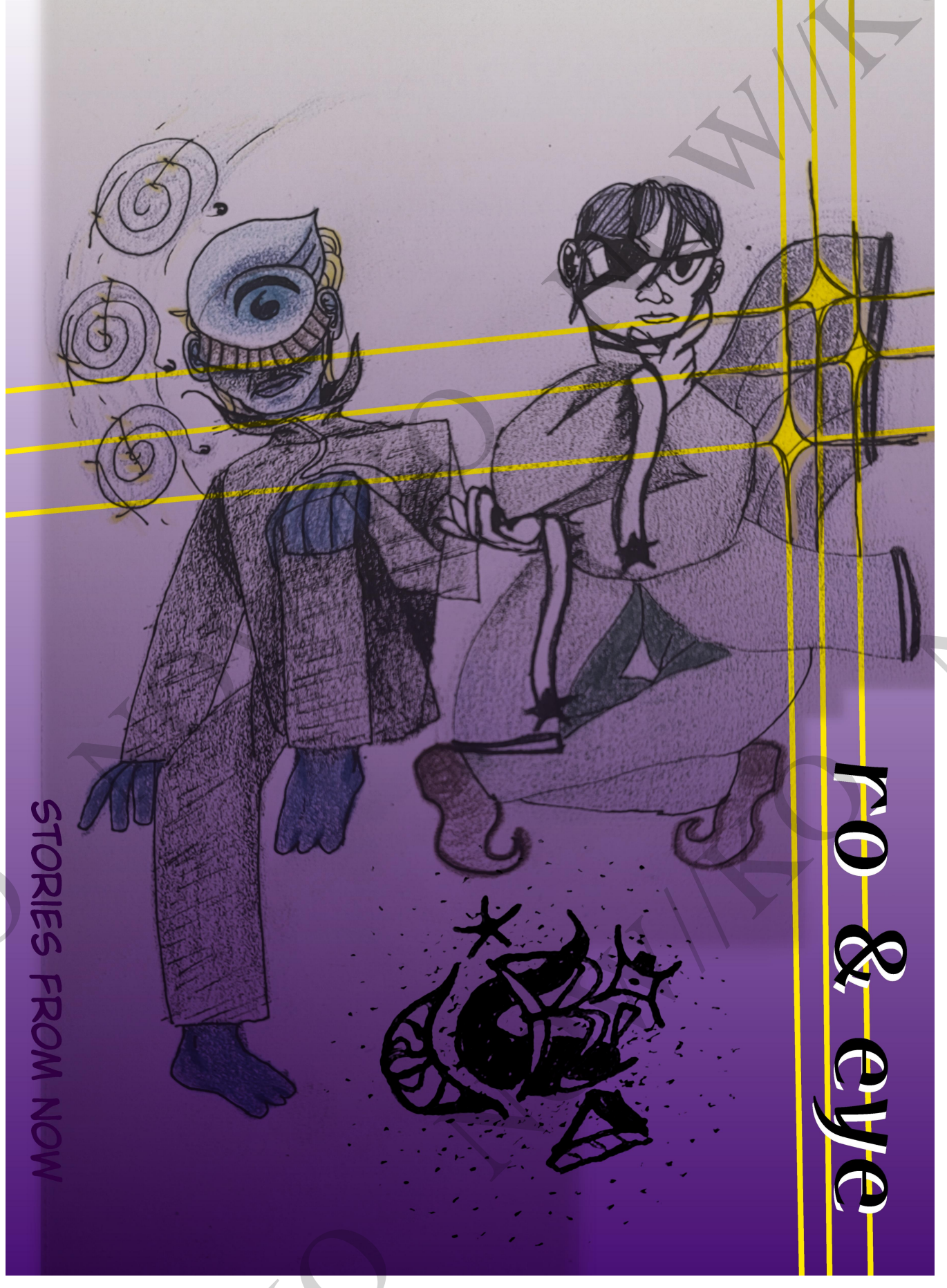
"Ro and Eye; Rewind Our Whereabouts" (Stories from NOW)